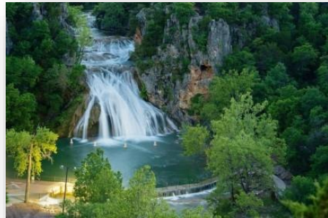
Little Niagra at Chickasaw