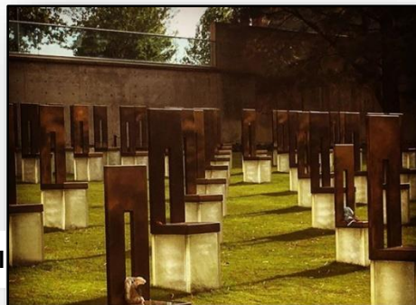
OKC National Memorial