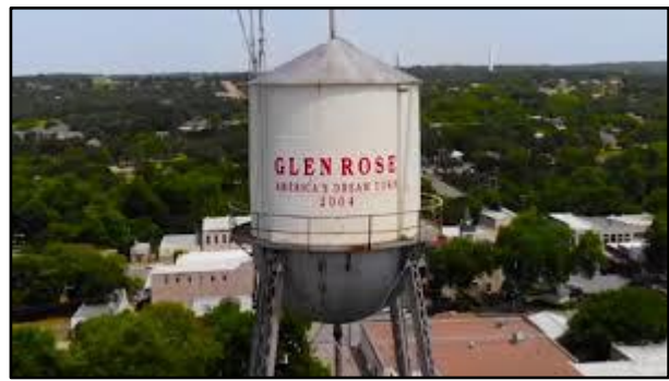
City of Glenrose