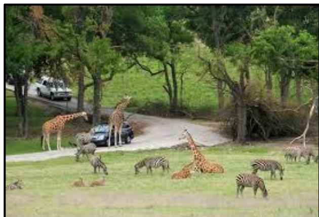
Fossil Rim Wildlife Park