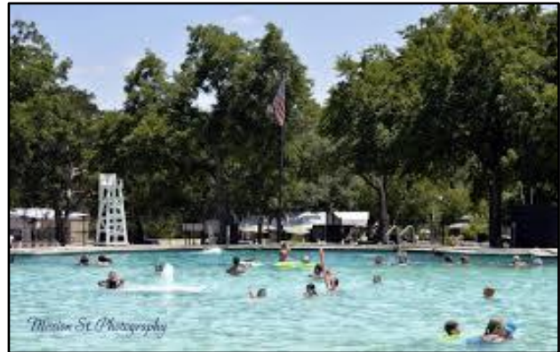
Oakdale RV Park