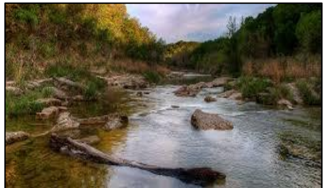
Dinosaur Valley State park